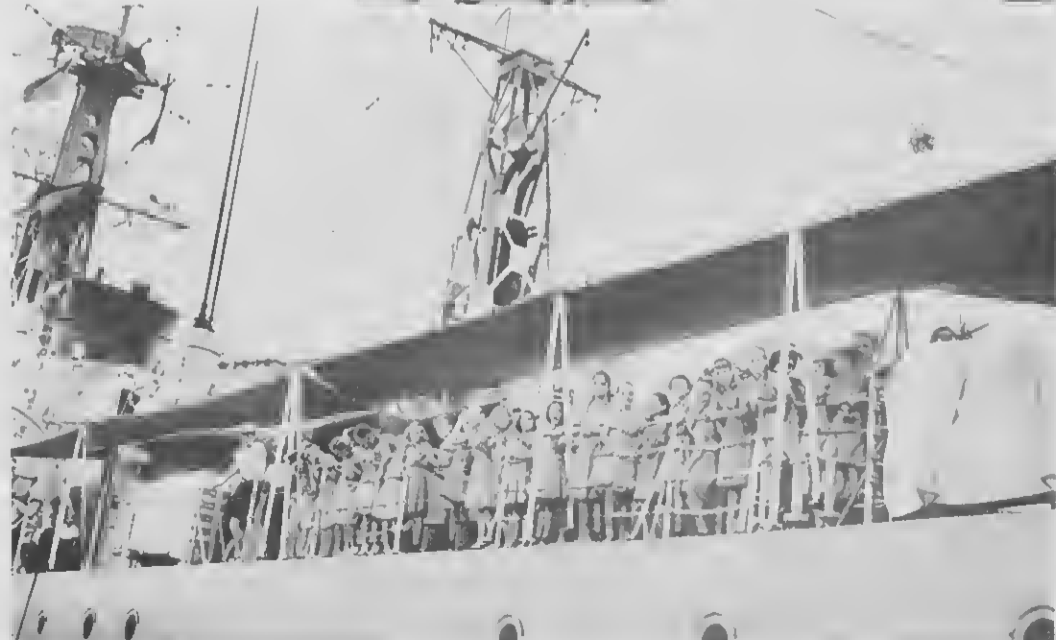
IN ADDITION to various island residents, the "Crescent" played host to a group of Brownie Scouts.